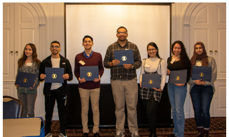
TRIO SSS 2022 Recognition Dinner.

Are you from a rural area or interested in advocating for underrepresented groups in higher education? Rural Area Student Initiative (RASI) is a new RSO focused on providing support and resources to UIUC students from rural areas as they navigate the transition to higher education. Additionally, RASI strives to mentor, advise, and advocate for rural high school students interested in pursuing higher education. If you're interested our mission, or want to learn more, please fill out this short (1-2) minute form: https://forms.gle/b8kvk7wtTw4nVN3D6